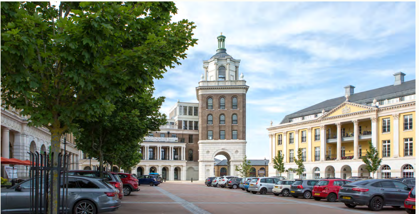
VIEW OF QUEEN MOTHER SQUARE TOWARDS ROYAL PAVILION