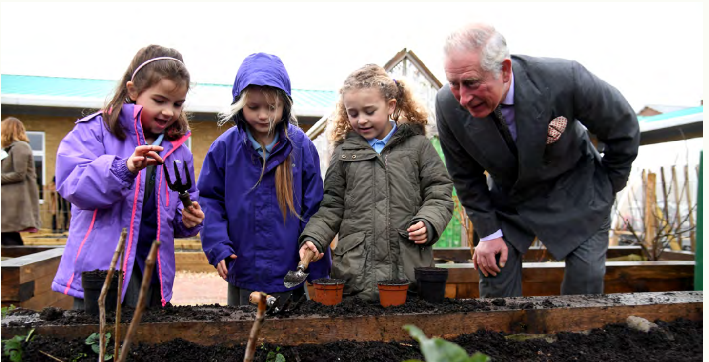
HRH THE PRINCE OF WALES BEING SHOWN DAMERS FIRST SCHOOL'S ECO GARDEN BY SCHOOLCHILDREN