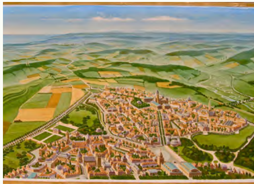
ILLUSTRATED MAP OF THE POUNDBURY VISION