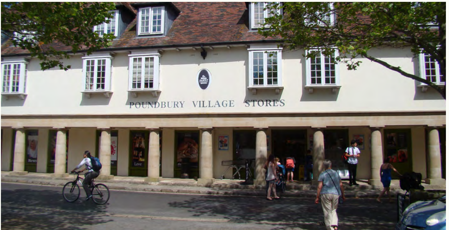
POUNDBURY VILLAGE STORES, AN INDEPENDENTLY RUN SHOP IN PUMMERY SQUARE