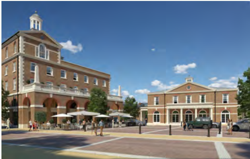
PROPOSED CROWN AND MARKET SQUARE

In the Northern Quadrant construction of the 350 homes has commenced. The North West Quadrant is the last phase of construction in Poundbury which is planned to start in 2022. By completion in around 2025 it is expected that Poundbury will have increased Dorchester's population by a quarter, some 5,800 residents, and created 3,500 jobs.