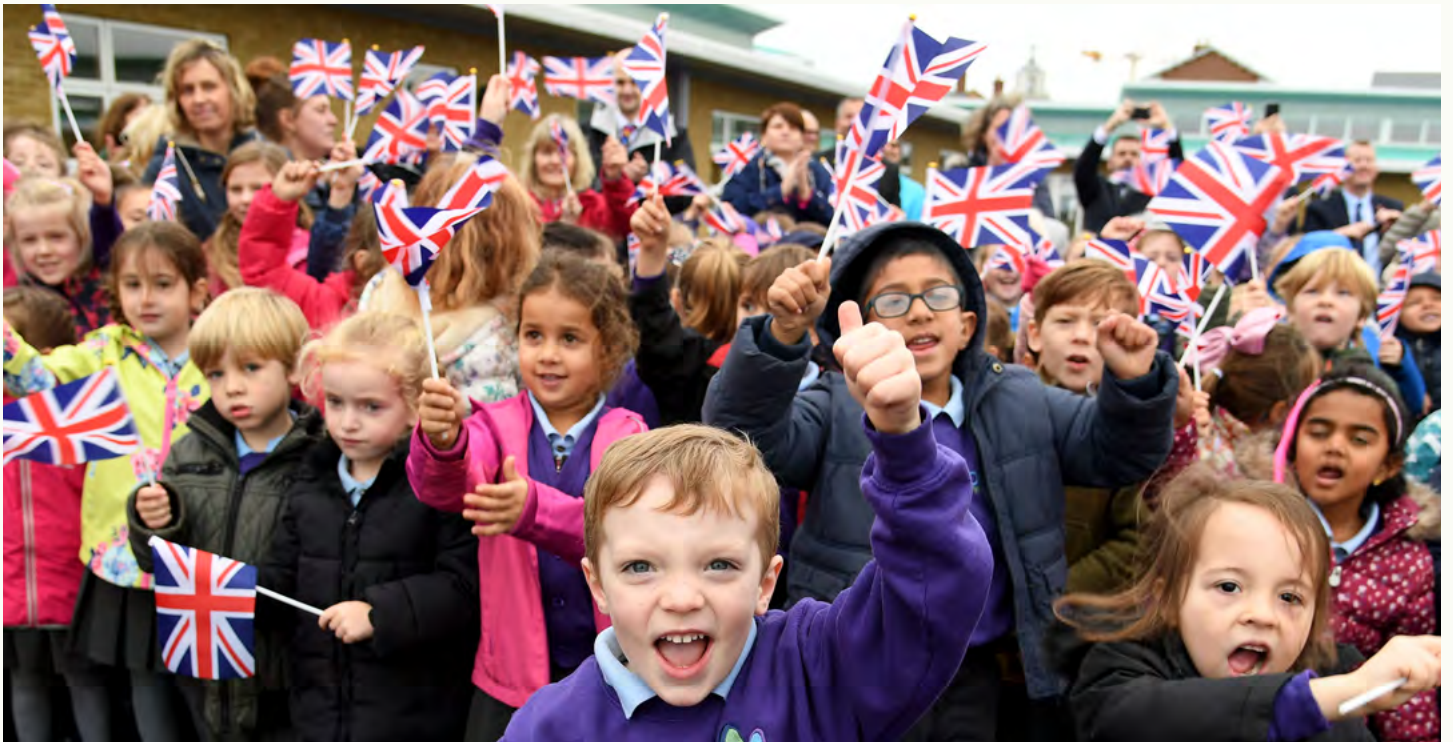
DAMERS FIRST SCHOOL CHILDREN