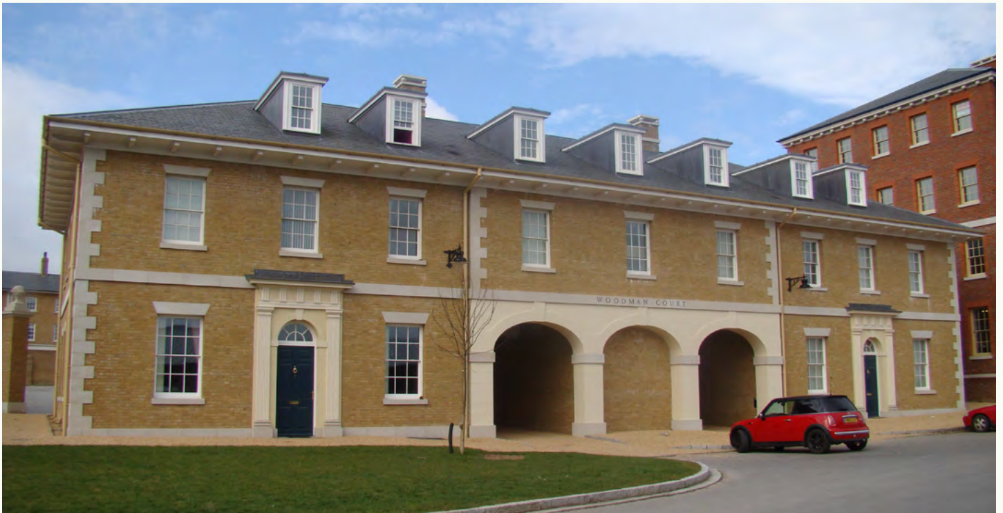
POUNDBURY IS DELIVERING 35% AFFORDABLE HOUSING INTERSPERSED ACROSS THE DEVELOPMENT