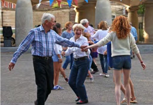
COMMUNITY EVENT IN PUMMERY SQUARE