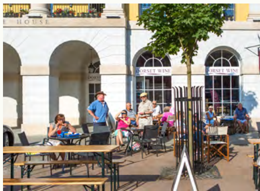
QUEEN MOTHER SQUARE