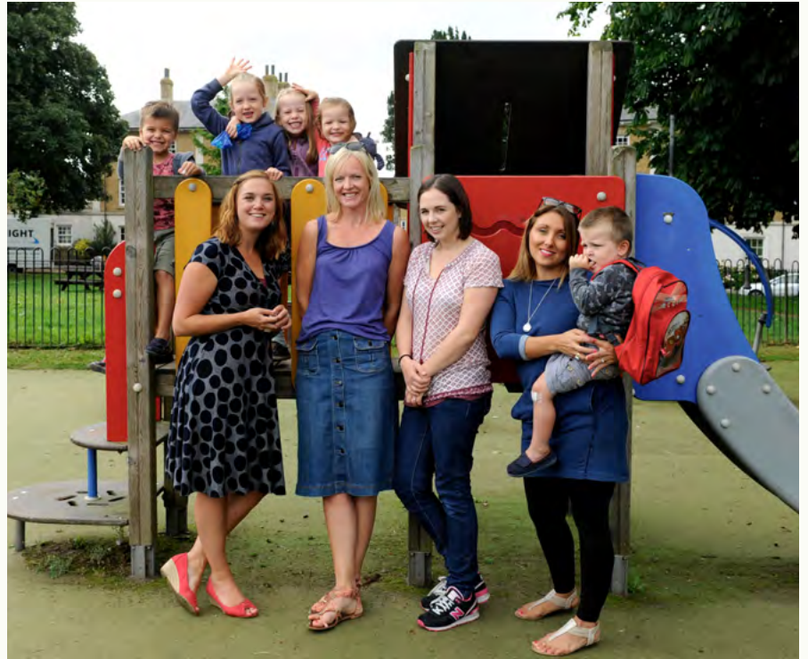
VOLUNTEER MUMS FROM CHEEKY MONKEYS PLAYGROUP