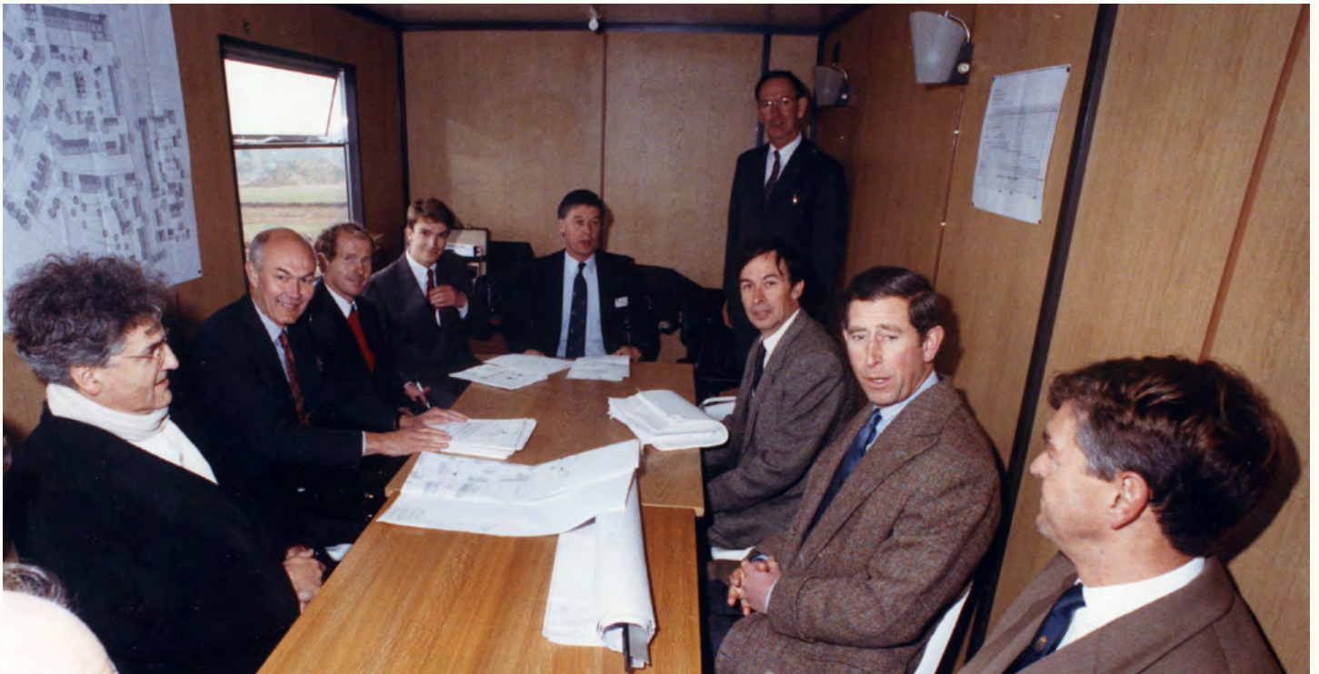
HRH THE PRINCE OF WALES AT THE FIRST SITE MEETING IN 1993