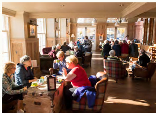
DUCHESS OF CORNWALL INN