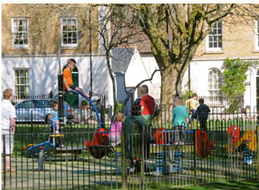
WOODLAND CRESCENT PLAY AREA