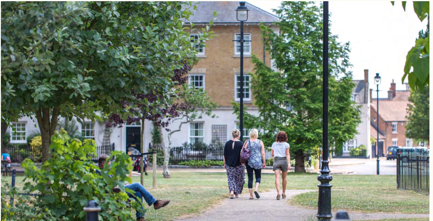
POUNDBURY IS DESIGNED SO MOST DAILY NEEDS CAN BE MET ON FOOT