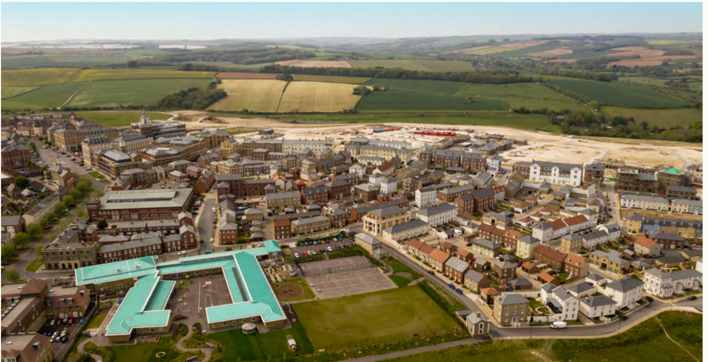
NORTH EAST QUADRANT, MAY 2019