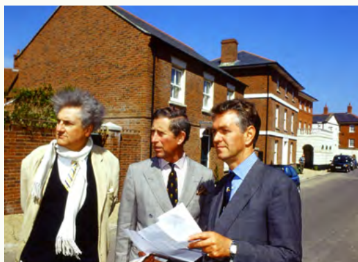
LEON KRIER AND ANDREW HAMILTON WITH THE PRINCE OF WALES