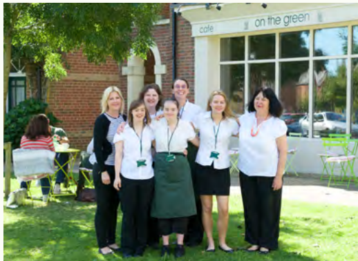
THE TEAM AT CAFE ON THE GREEN