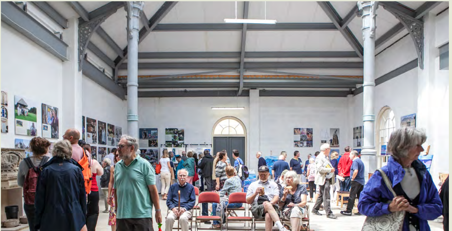
AN ART EXHIBITION AT THE RESTORED JUBILEE HALL