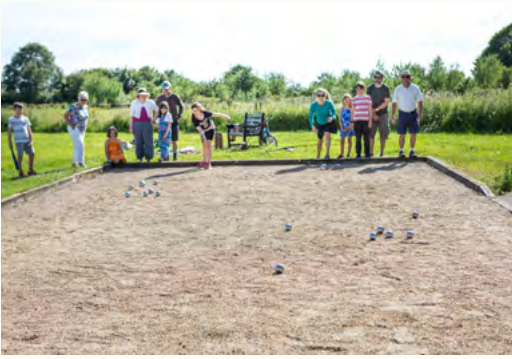
FAMILIES PLAYING ON THE PÉTANQUE AREA