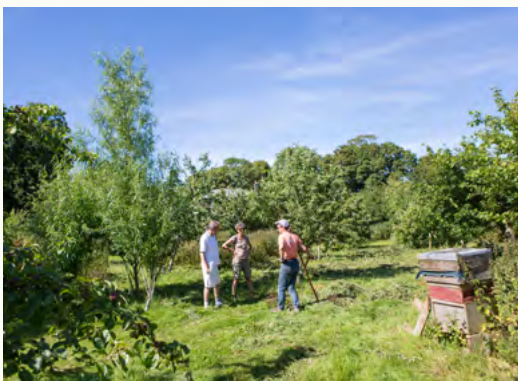
GARDENERS AT POUNDBURY ALLOTMENT GROUP