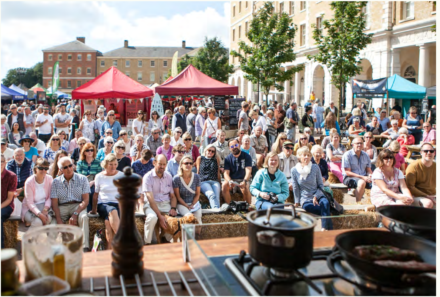
DORSET FOOD & ARTS FESTIVAL HELD EVERY AUGUST IN QUEEN MOTHER SQUARE