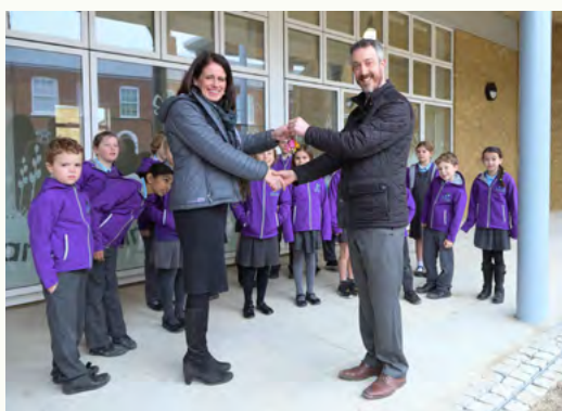
DAMERS FIRST SCHOOL OPENING