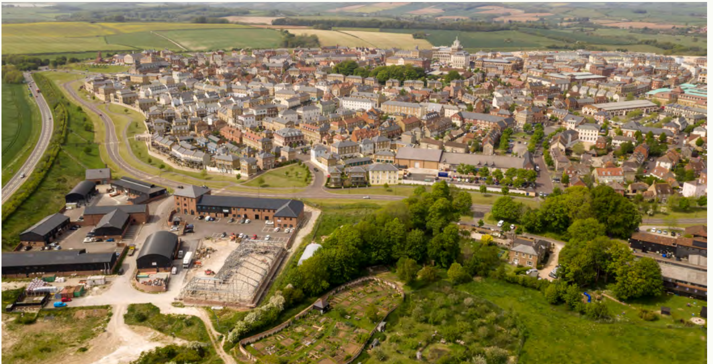
AERIAL PHOTOGRAPH OF POUNDBURY MAY 2018