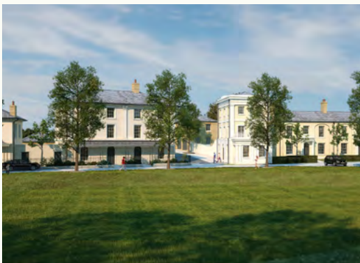
PROPOSED VIEW OF THE NORTH WEST QUADRANT