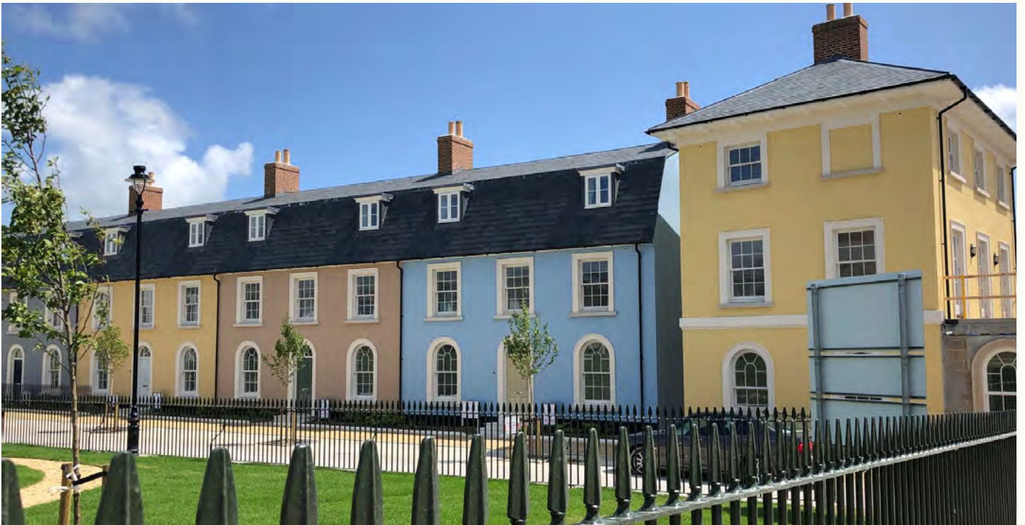
HAYWARD SQUARE WITH A BUILT IN BIRD BOX ON THE TOP RIGHT OF YELLOW BUILDING